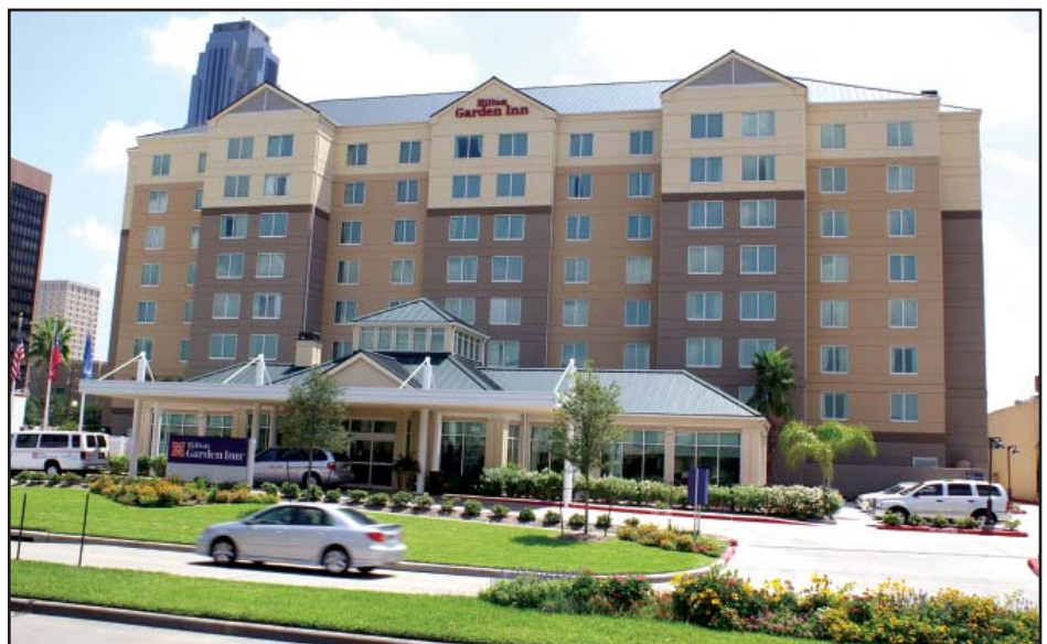
Hilton Garden Inn

Current Manpower: 325 (drywall and plaster)