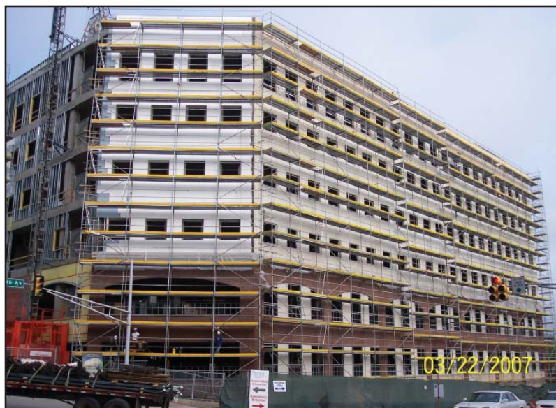
All Saints Medical Office Building

Current Manpower: 115 (drywall and plaster)