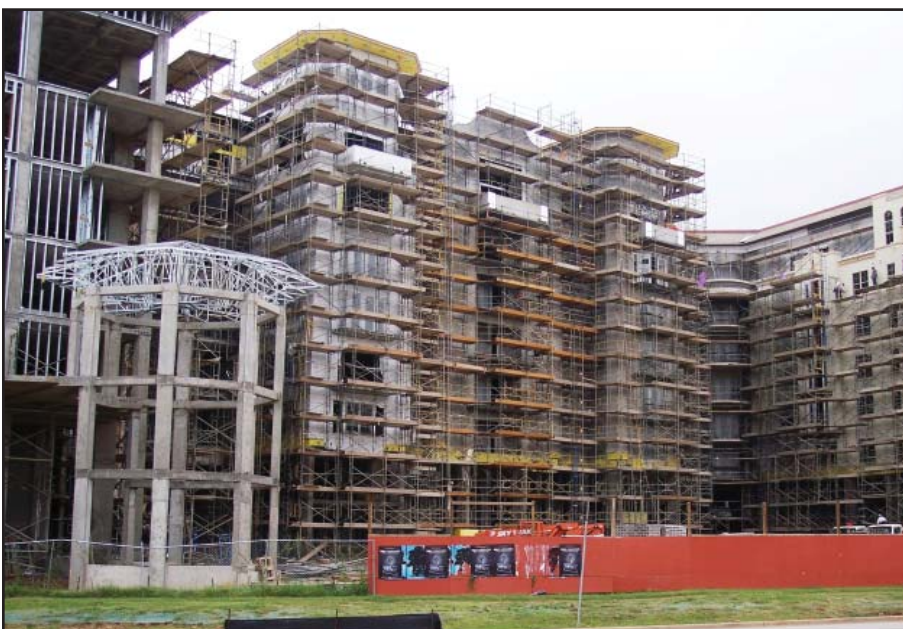
Villa Rosa in Downtown Dallas

Current Manpower: 550 (drywall and plaster)