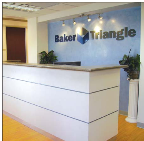
A refreshingly remodeled entryway

As it all came to a close, we have miraculous results. The entrance and reception area now has a beautiful wood floor and a reception counter with a Venetian finish on the front of the counter and the back wall. We have added a BakerTriangle sign behind the reception area for that official look. Now from the roadway, everyone passing by