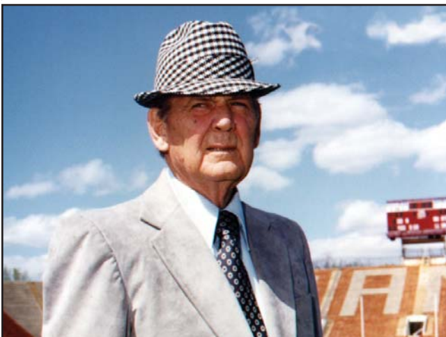
Coach Bear Bryant

managers rely on a team meeting with the estimator and foreman to discuss the start of a project. Then on a project, our team usually includes a project manager, a foreman, and a superintendent all working together with talented drywall mechanics, lathers and plasterers to achieve the same goal – building a safe and quality job.