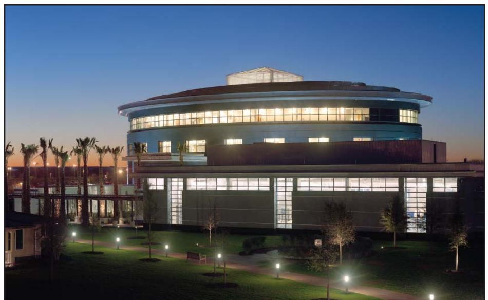
Center for the Intrepid at Dusk