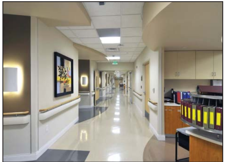
Baylor All Saints Women's Center