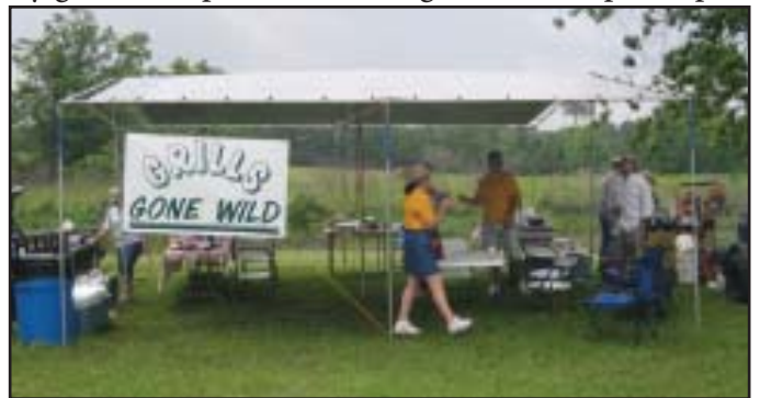
'Grills Gone Wild' Team wins Best Team Name