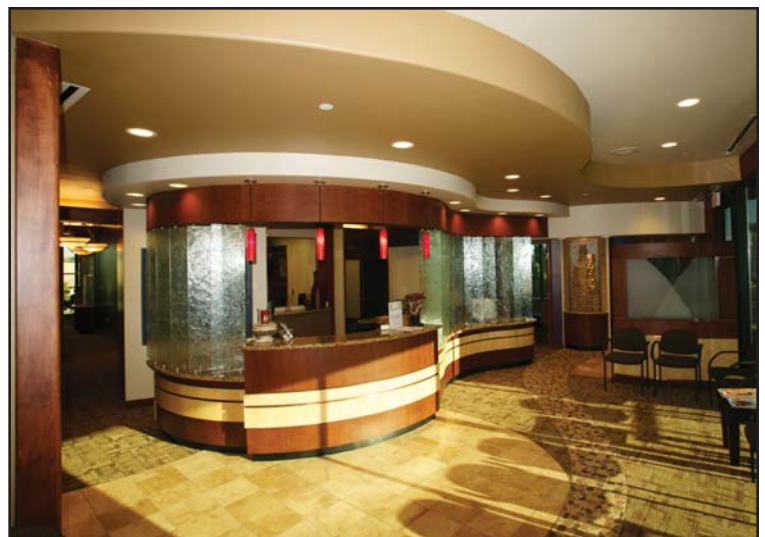
Ocotillo Professional Building

I just want to say thank you again to my BakerTriangle family for your support as we have made this transition in the past year. 🙏