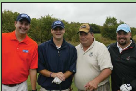
The happy Herb's Paint and Body Team

of several new Partner sponsors, the tournament posted record receipts.