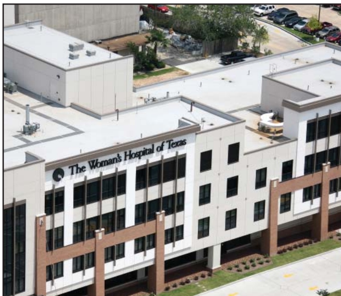
The Woman's Hospital of Texas